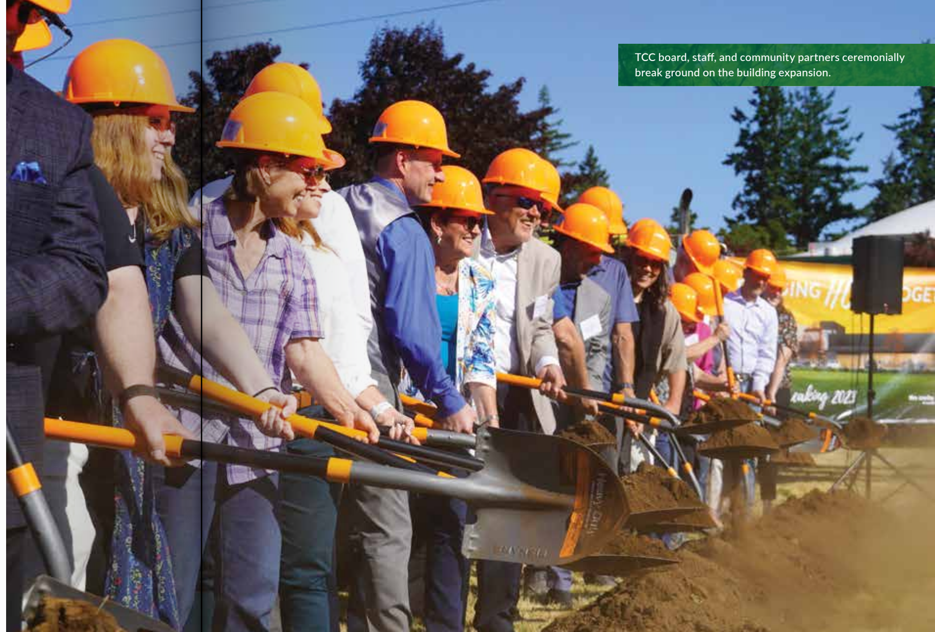
TCC board, staff, and community partners ceremonially break ground on the building expansion.

Grow with us! Scan to learn more about the building expansion.